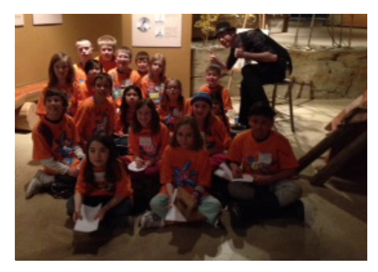
A big thank you goes out to our Parent Council for helping fund the buses and parent volunteers.