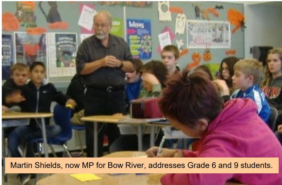
Martin Shields, now MP for Bow River, addresses Grade 6 and 9 students.

students were engaged in learning about the political process in Canada and I feel confident that they understand that voting is both a right and a responsibility in a democratic country. Our future is in good hands.