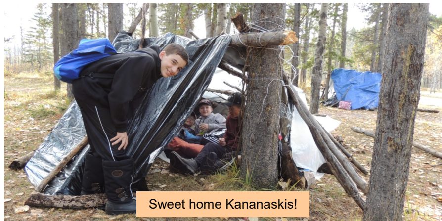
Sweet home Kananaskis!

On October 5th and 6th the Outdoor Education option went on an overnight excursion to Paddy's Flats in the Elbow Valley. It was a fantastic trip, everyone had a great time and learned a lot. One highlight was the shelter building, where students were taught to build their own sleeping structure, from branches, string, and tarps. Hard work and creativity came to the fore as each group designed a unique shelter. Another 'hot' activity was the fire lighting contest where the campers had to use a flint and steel to light a fire, then build their blaze up large enough to burn through a rope