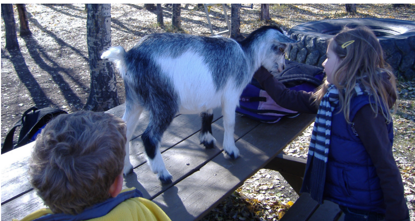
This billy-goat didn't seem too gruff to Riley.

Many thanks to everyone who sent in Halloween treats and attended our spooky sing-a-long.