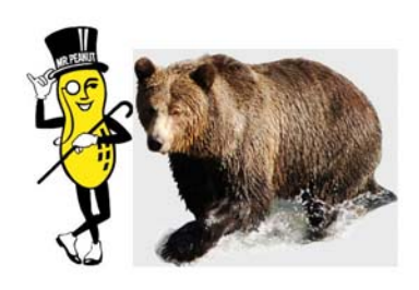
Who's more dangerous?

sensitive that the tiny particles floating in the air (our noses sense them as smell) can cause a life threatening reaction.