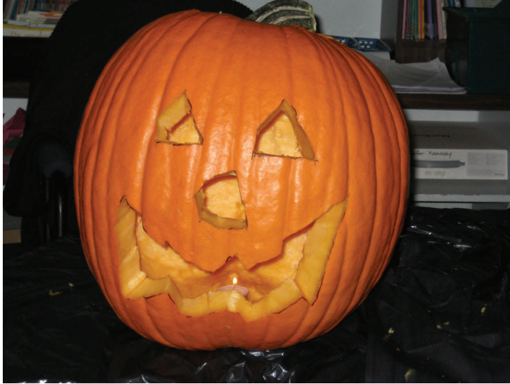
All of the Grade 1 students participated in the creation of Jack.

estimated and counted pumpkin seeds (and ate them, too!).