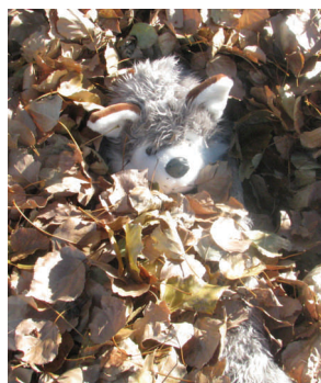
A wolf under the leaves... Un loup sous les feuilles

mois prochain. Demandez à un élève de 7 e pour en savoir plus!