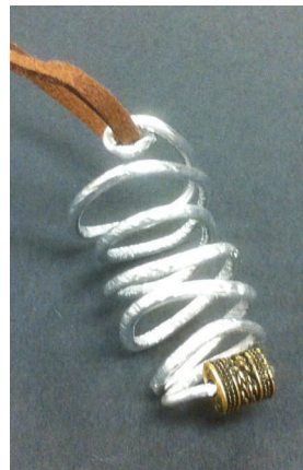
Jewel , Gr. 7