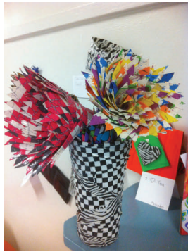
Chelsey, Gr 9